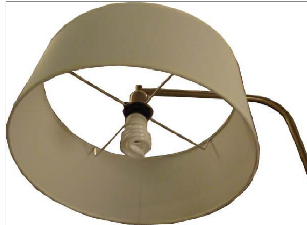
2 DETAIL N.T.S.

SCALE DATE AS NOTED 11.04.2011 DRAWN BY CHECKED BY RA