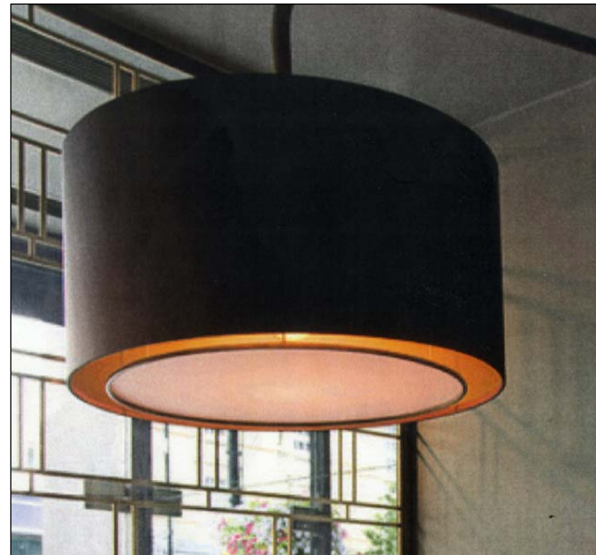
3 DETAIL TOP AND BOTTOM SHADE IMAGE REFERENCE